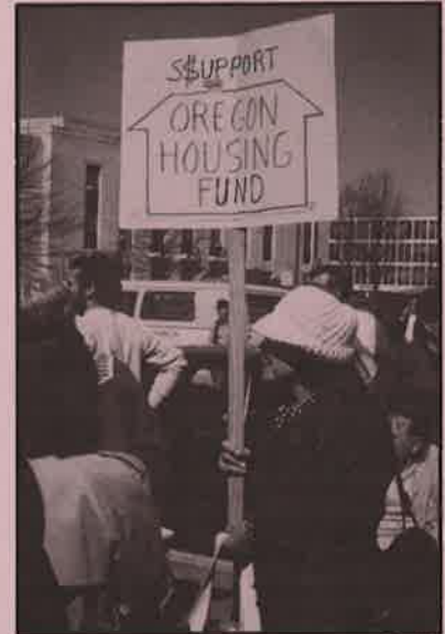
Demonstrators at the State Capitol Building rally for affordable housing for all Oregonians.