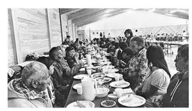
Dedication Dinner at the Simnasho Longhouse

Protection of life and property is the mission of the Tribal Police Department, and for the past two years there have been no tribal member fatalities in vehicle accidents related to alcohol within the reservation boundary. Indeed, Tribal Police Officers have produced positive, significant results in an area of major concern to our community. Community involvement has increased resulting in support of the department, and a decrease in crime such as burglary and driving under the influence.