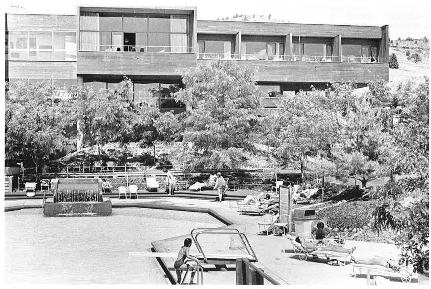
Kah-Nee-Ta Hotel Pool

After an effort of nearly twenty-years by the Columbia River Treaty Tribes and other fishery interests, 1985 saw the climax of negotiation and implementation of an international treaty with Canada for the management of salmon migrating between the two countries. It is expected that the new U.S.-Canada Pacific Salmon Treaty will go a long way toward restoring the Columbia River chinook salmon runs to their former greatness.