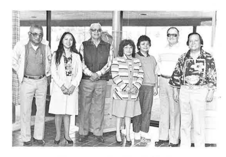
Middle Oregon Indian Historical Society