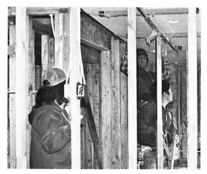
JTPA Apprenticeship Program

Under the JTPA apprenticeship program, there are four tribal members and two other Indian carpenters, who are now working on building two houses at Wolfe Point. Upon completion, the JTPA apprenticeship program will have built four homes including the two they completed in 1984.