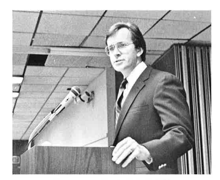
Congressman Les AuCoin (D-OR)

On November 26 the Senate Judiciary Committee reported out Bill, S. 1818, making the sexual molestation of children in Indian country a federal offense. Similar legislation, H.R. 3826, is pending in the House of Representatives.