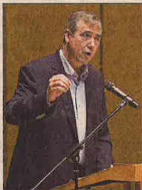
Senator Jeff Merkley outlines his views on a wide range of current issues discussed in a town hall meeting Sunday at Pacific University.