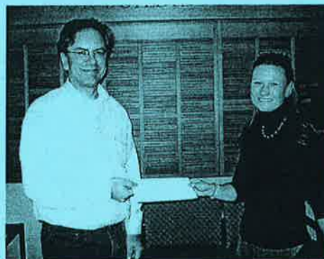
$561.00 raised by GAP Employees and will be matched by GAP Inc.

Please contact Alicia if you need more applications sent to you to share with families. The application deadline is Wednesday, Dec. 1 st .