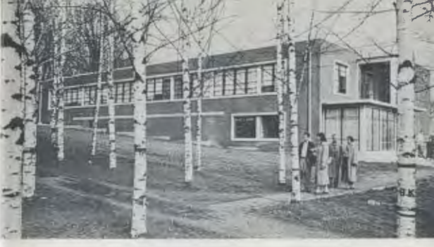
Optometry—Jefferson Hall, recently completed classroom and clinic for the College of Optometry.