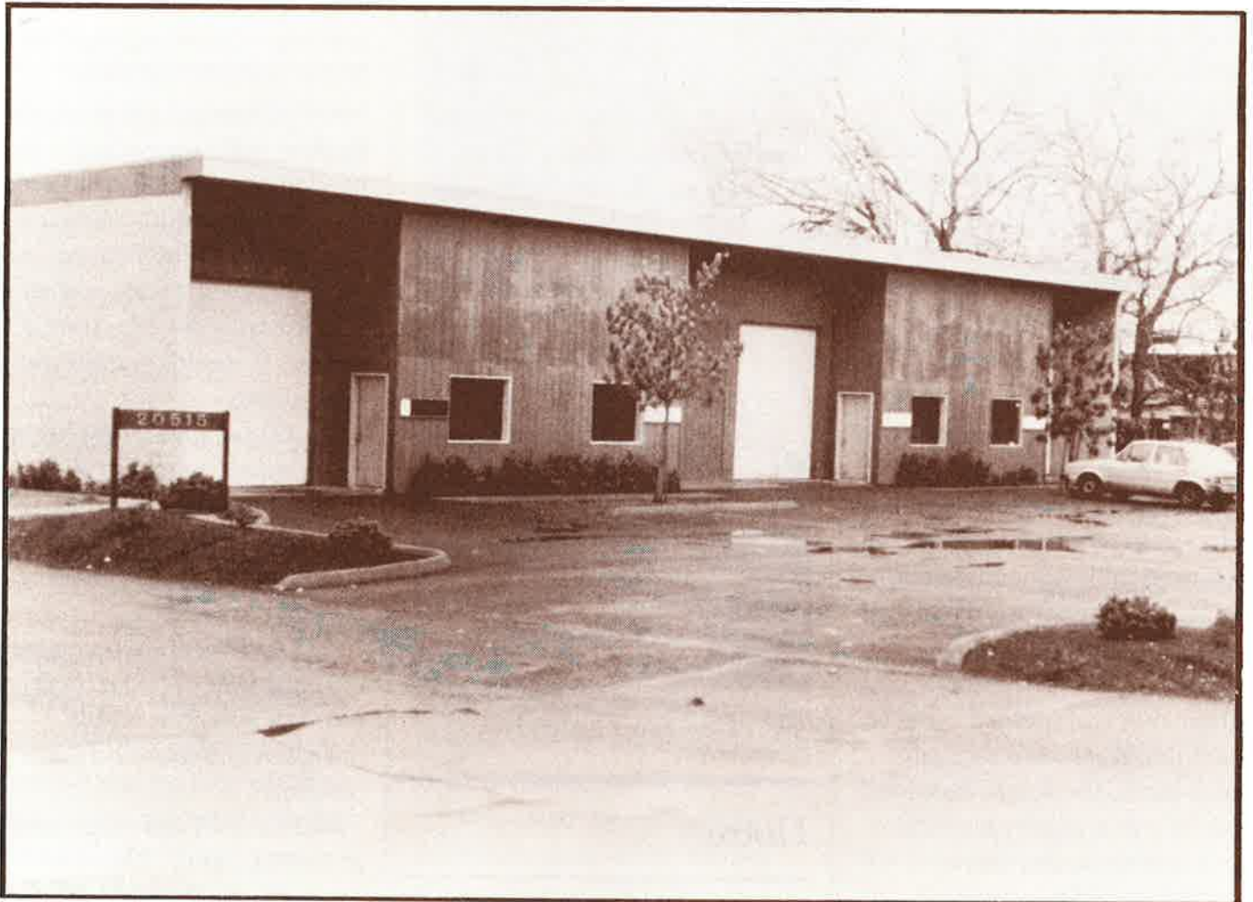
New home of the Tualatin Valley Food Center, Inc. 20515 Blanton, Aloha

*$1,598.00 were raised through local fundraising efforts.