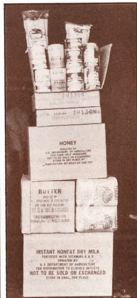
Some food stuffs available through the Tualatin Valley Food Center, Inc.

T.V.F.C. is a county-wide food distribution network which exists to coordinate the solicitation, storage and distribution of donated food. Over 20 local