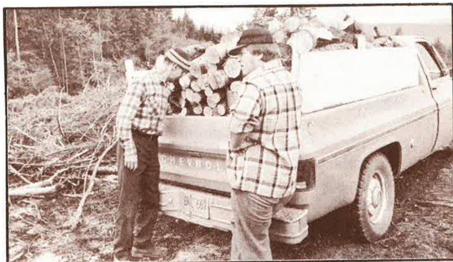
Two Wood Gleaners prepare to return to Wood Coop to share wood with those unable to cut for themselves.

The Community Self Reliance Program provides technical assistance and organizational support needed to create or strengthen volunteer efforts aimed at ameliorating poverty while enhancing community self-reliance in Washington County. During the fiscal year 1982-83 support was given to the Washington County Crop Gleaners, Inc., Tualatin Valley Food Center, Inc., and the Washington County Wood Coop.