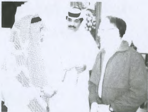
Figure 1. Ali Al Ali and HE Hassan Al Ghanim tell US Ambassador to Qatar, Chase Untermeyer, about their college days at PSU

HE Hassan Al Ghanim, Minister of Justice, State of Qatar; PSU alumnus, class of 1979