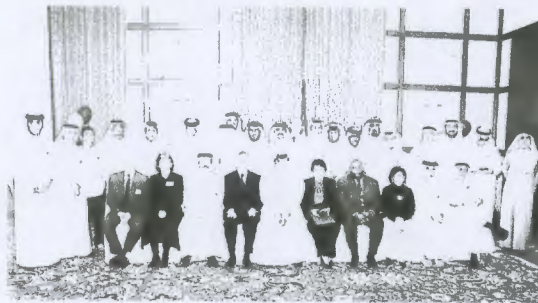
2 PSU GCC alumni at 2006 reunion in Kuwait

GCC alumni lead the way in supporting PSU Middle East Studies: $168,000 donated, much more pledged. Thank you, Alumni!