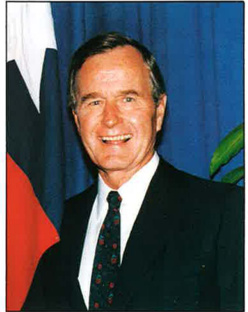
Vice President George Bush

The Bush Family wishes you a Merry Christmas and a Peaceful New Year