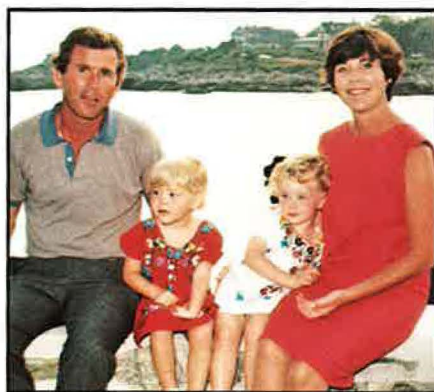
George, Laura Jenna & Barbara Texas