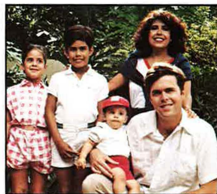
Jeb, Columba Noelle, George & Jebby Florida