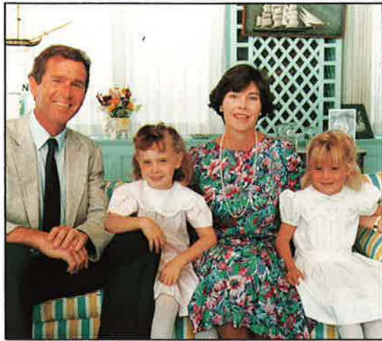
George, Laura Barbara & Jenna Texas