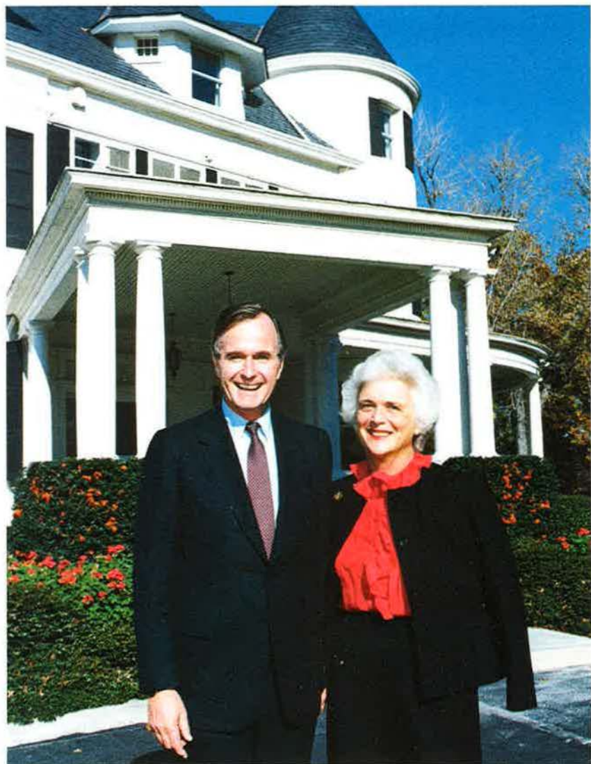
GEORGE AND BARBARA BUSH