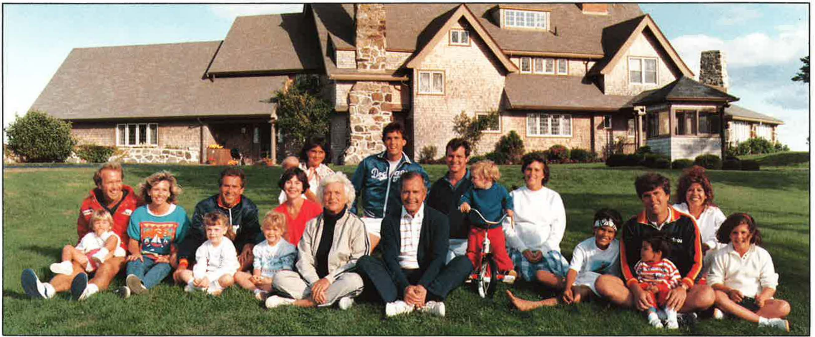
Bush Family 1986