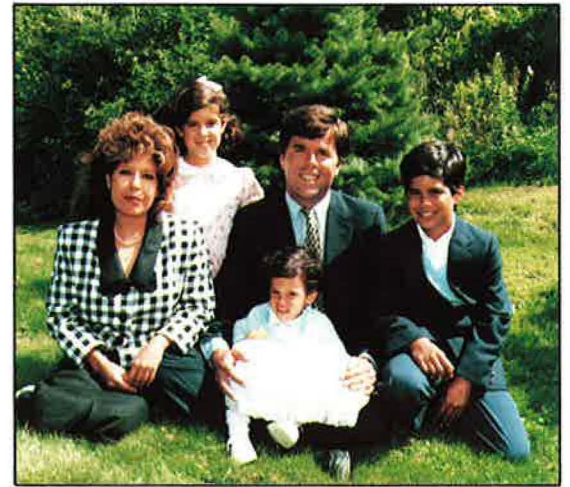
Jeb, Columba Noelle, Jebby & George Florida