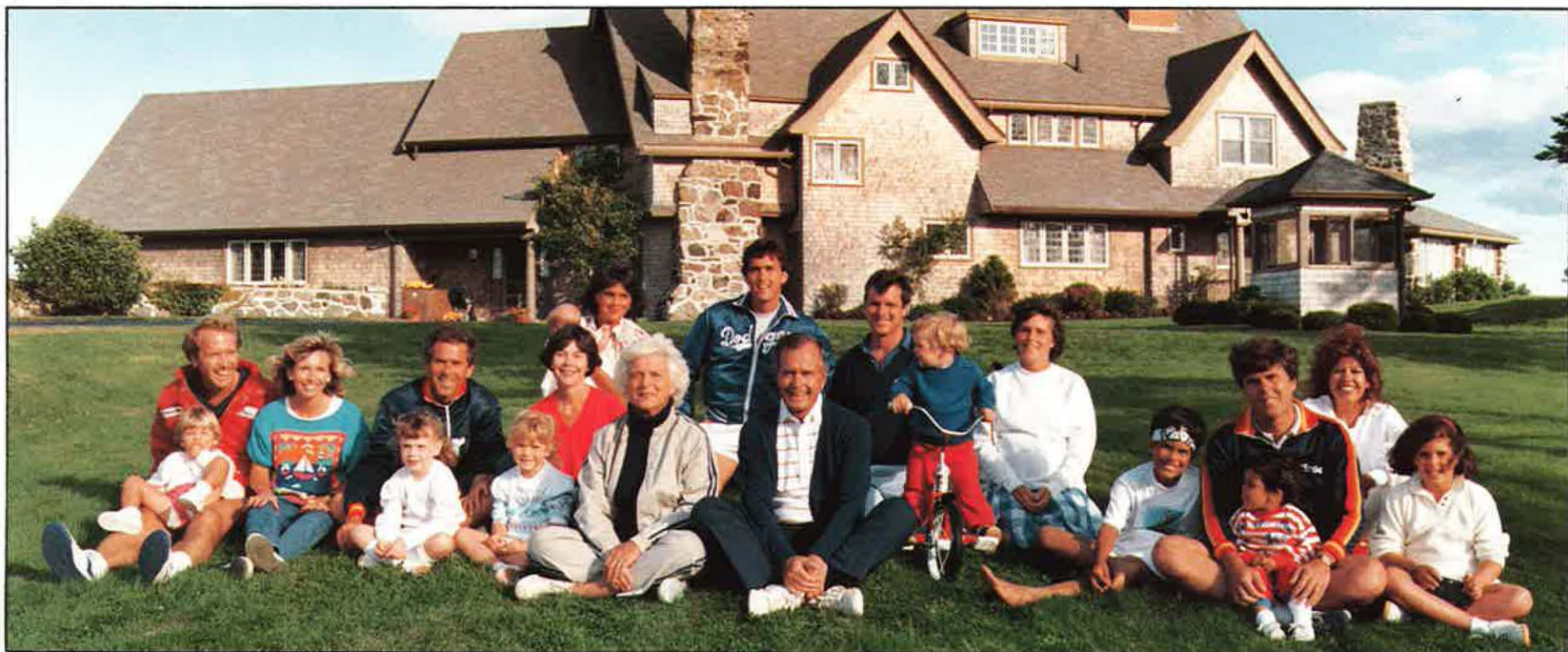
Bush Family 1986