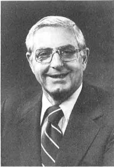
Victor Atiyeh Governor

State Capital Salem, Oregon 97310 Tel: (503) 378-3111