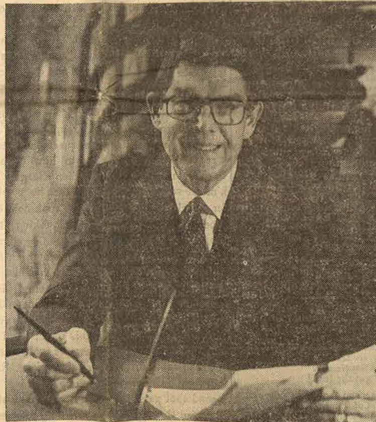
JOHN V. EVANS, Governor

OFFICE OF THE GOVERNOR STATE CAPITOL — BOISE 83720