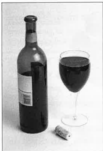
Grapes in this fine wine are picked by Oregon farmworkers. 8,800 acres of grapes for wine were harvested in Oregon in 2001. Oregon Agricultural Statistics Service, www.nass.usda.gov/or/annsum2002.htm

OHDC's Organizational Structure allows multiple programs to coexist in an efficient manner. For all Oregon communities we work in, programs are tailored to fit the specific needs of those customers.