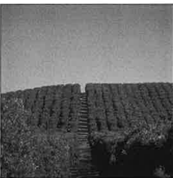
Whether picking tree fruits and nuts, or harvesting row crops, farmworkers in Oregon make an impact on our daily lives.

These meetings revealed that language skills are the most essential to farmworkers obtaining stable employment. Sadly, ESL classes are at risk as community colleges struggle with shrinking budgets. OHDC staff are working to partner with other agencies to make as much ESL and basic skill education available as possible in each of the communities we serve.