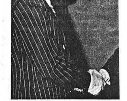
اءاجتماعهمم فالدهايم في بغداد