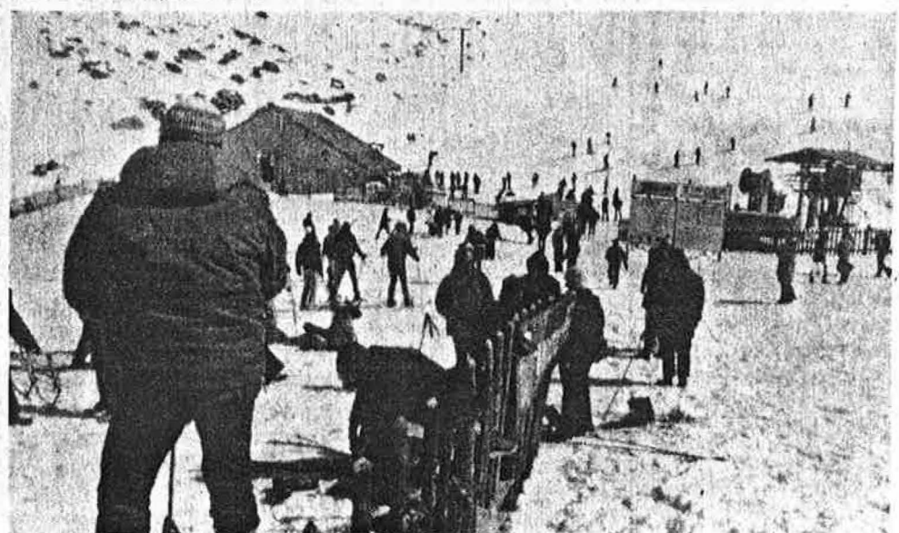
تلقت « الازوار » همده المعورة من وكالة « اسوشيتدبرس » ويسدو فيهسما جنسود اسرائيليون يمارسون التزلج في الجولان وسط هراسة بنادق زملائهم

سناتور أو نائب في الكونفرس الاميركي. فاعضيساء المجلّسيس التشريعيسي يسئون قوانينهم الخاصة ويتخسسلون يقترهها الحاكم ، تماما ، كما يطور اعضاء الكونغرس قوانينهم الخاصة اجراءات بصدد النشريعسات التسسى ويتغلون اجراءات بصدد تلك التسى يقترهها الرئيس .