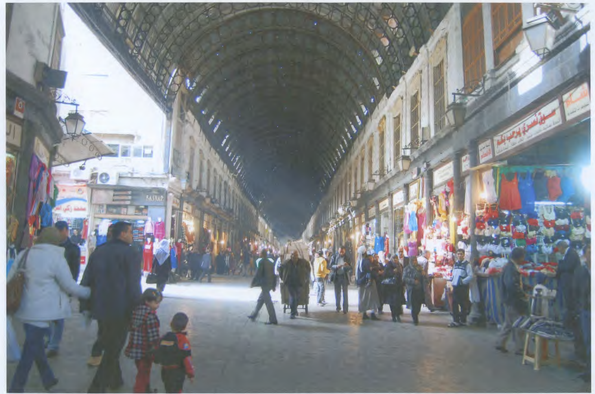
Souk al-Hamidiyya, Damascus