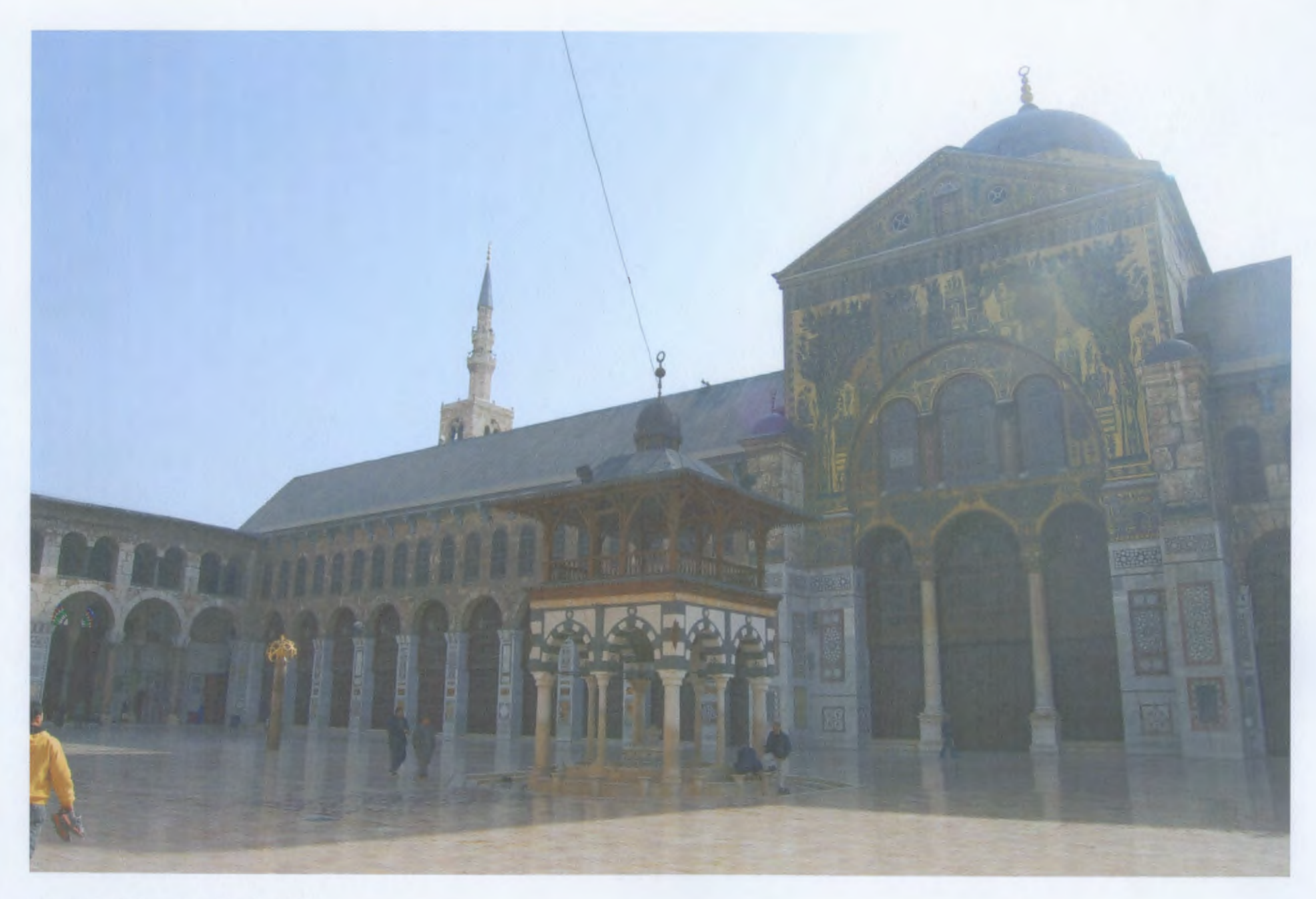
Umayyad Mosque, Damascus