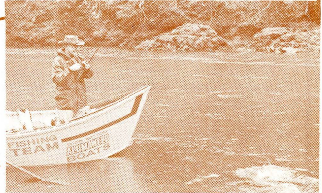
Gov. Atiyeh with fish on!

The Contributors' generosity is a testimonial to the value placed on Oregon's fish and wildlife and the right of the people to enjoy them. Without the help of the public, the two Deschutes River land acquisitions could not have been accomplished.