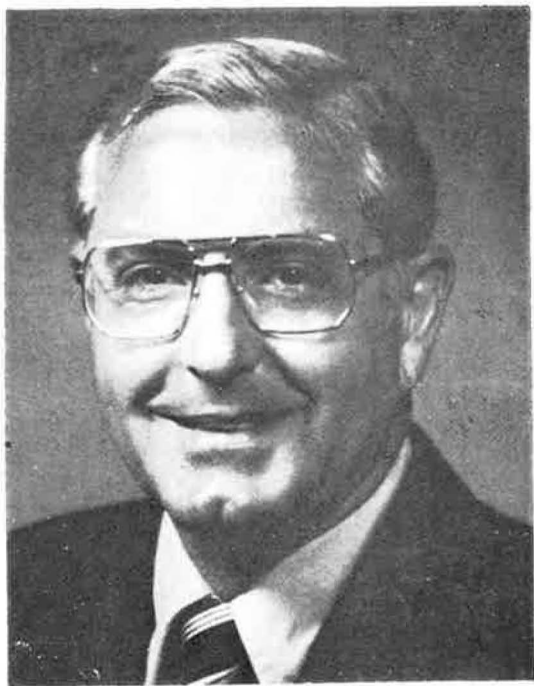
艾提葉州長玉照 Governor Victor G. Atiyeh